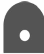
End cap with hole (C)