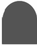
End cap (B)