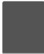
End cap (B)