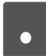
End cap with hole (C)