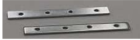
180 Degree Joiners