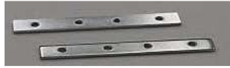
180 Degree Joiners